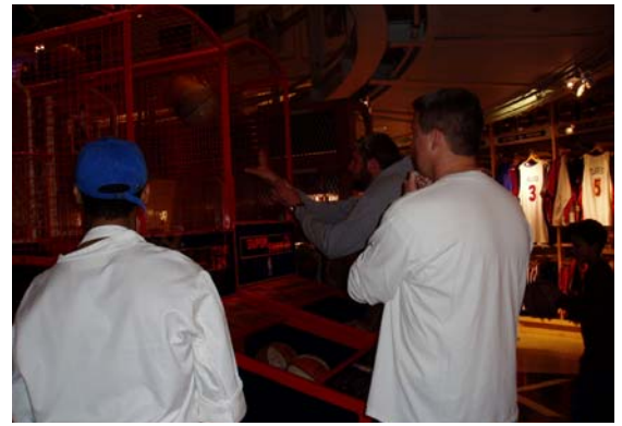
Catching up on the BB scores!