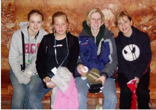
“We are too awake!”

We were up and ready to go this morning at 8:30 for some shopping in New York City – at least the hard-core shoppers were ready and full of energy! We have finally arrived at our final day of the trip. So much has happened, and we are so thankful for the many things we have seen and learned in the last week.