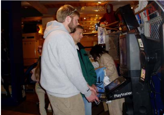
A video game or two?

We could have easily spent an entire day walking around the city, but unfortunately we had to fly back very early in the afternoon. It was a wonderful trip, and we saw many things that we will never forget, but we were also ready to go back home after a very tiring week.